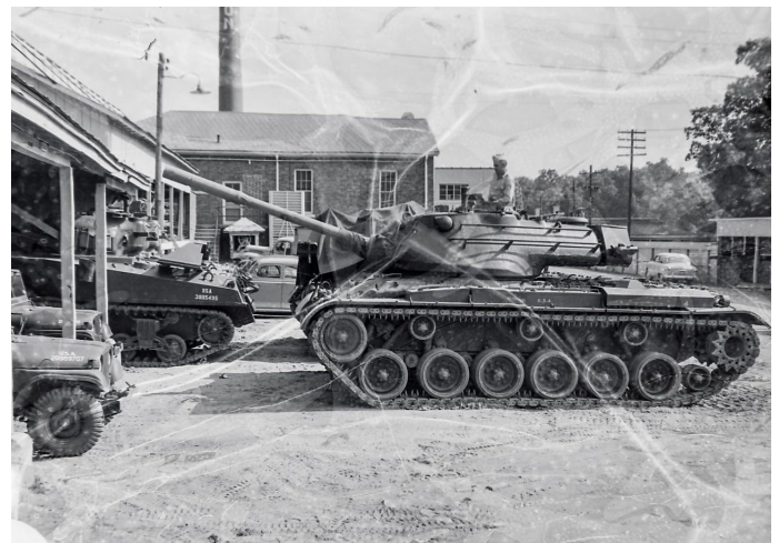
Above is a close-up of the tank parked in the Klugh Ave. back lot.

If you have information, an article, upcoming event or compliment you would like included in future Facilitator issues, please send the information to: